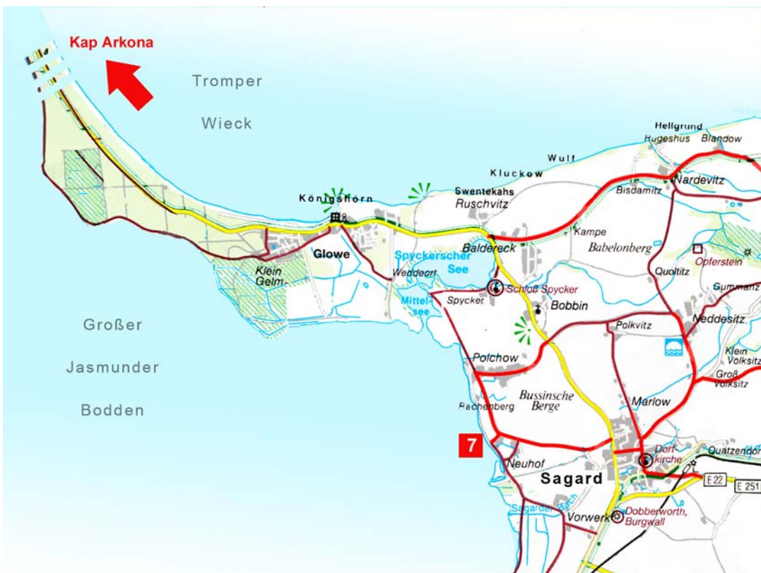
Figure 1 and 2: Area Kap Arkona